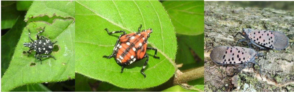
Photos: Early and fourth instar nymphs, and adults of spotted lanternfly.